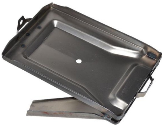
Made in USA Tray

Pictured above on the right is a phosphate coated C1 battery tray ( part #171301 ), along with a black e-coated tray that is a foreign made copy. The black tray is a good reproduction, as well as an option if your top priority is saving $20. However, readers should be aware that the black coating, known as “e-coating”, is not recommended by most professionals as a “weld-through primer”. In short, there are health risks associated with welding fumes. To avoid this issue, it is recommended that the e-coating be blasted or ground back in the weld areas. If your intention is to burn off the coating by welding, make sure the resulting fumes are directed away from you in a well-ventilated area.