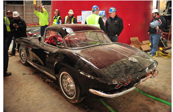
1962 C1 from the NCM Sinkhole