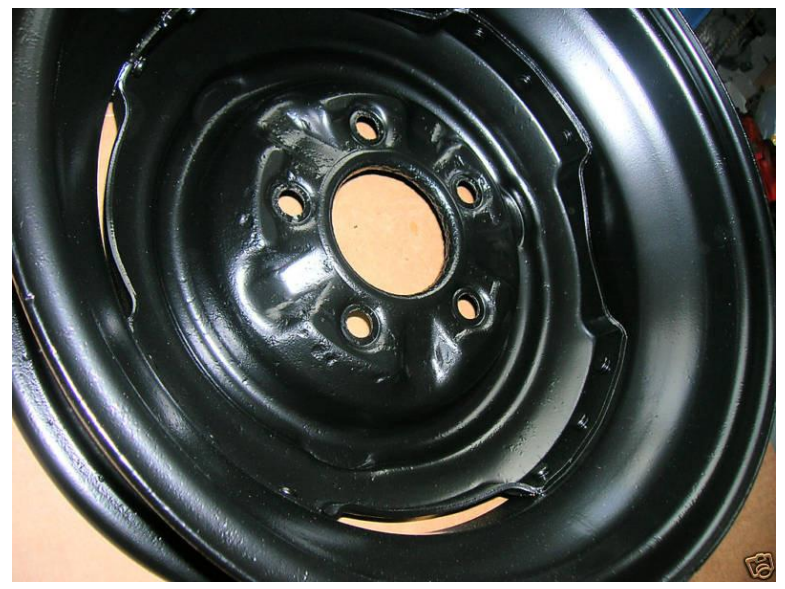
1953- 54 riveted, 1955-62 Pass car

In pulling off the tire/wheel assembly I found two unexpected problems. First, one of the wheels had elongated holes and second, only one of the 5 rims was correct. Some dunderhead owner (I wonder who?) had put riveted rims on. Doing some research, I found three different 15 x 5 steel Corvette wheels: