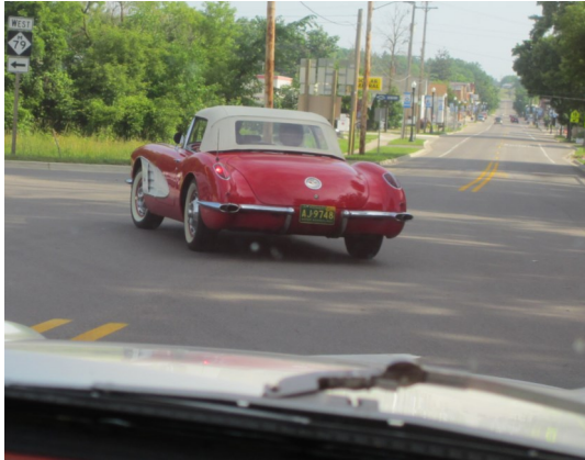
On the way to Hastings....

DREAMCRUISE WEEK—ENJOY THE ATMOSPHERE!!!